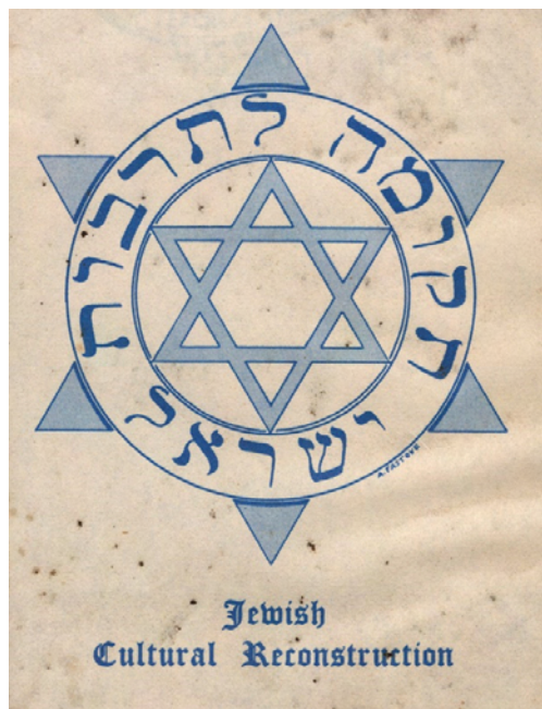
Figure 3: JCR bookplate on inside cover of book

While this chapter focuses on the activities of the JCR carried out by scholars such as Salo W. Baron, Judah Magnes, Gershom Scholem, Max Weinreich and Hannah Arendt, to name a few, its establishment, mandate and the implementation of its mission can only be properly explained and understood by briefly outlining what preceded the JCR. Weight will also be given to the historical and political framework surrounding the organization, all of which ultimately determined its success.