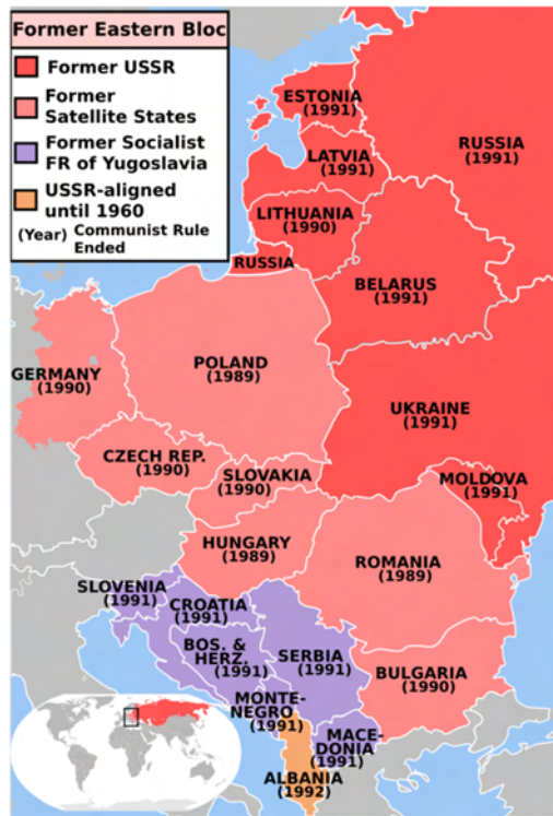
Figure 10: https://en.wikipedia.org/wiki/Iron_Curtain

The following briefly examines the fate of Judaica in the countries of the East after World War II ended. While much has been and may be written about the fate and suppression of Jewish communities and Jewish life in general during Communism, here the focus is only on the journey and losses of Jewish ritual objects as a result of communist rule. The following overview, divided into two political spheres – examples of countries that were aligned through the Warsaw Pact, 319 as well as an overview of countries that were part of the former Soviet Union – aims to outline the journey of communal and private property during Communism, as well as developments since 1989 and the official fall of the Soviet Union in 1991.