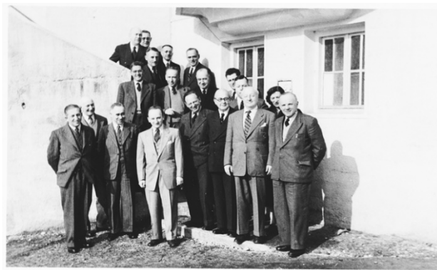
Figure 5: Group portrait of members of the Jewish Restitution Successor Organization (JRSO) at a staff conference in Nuremberg, Germany, ca. 1949.

The foundations for what later was to become the Jewish Restitution Successor Organization (JRSO) emerged in the summer of 1945, when five American-based Jewish groups formed a committee to represent Jewish interests in reparations and restitution negotiations. The JRSO was originally called the Jewish Restitution Commission, but it changed its name to the Jewish Restitution Successor Organization at the request of the Military Government. 224 Another impetus for the creation of the JRSO was the founding of the Commission on European Jewish Reconstruction, also in 1945. And similarly to the JRSO, the Commission on European Jewish Reconstruction was incorporated two years later, in 1947. 225 The driving force behind the Commission were American Jewish religious leaders, scholars, and teachers, 226 headed by Professor Salo Baron of Columbia University.