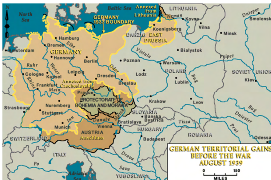
Figure 1: "German Prewar Territorial Gains" https://www.ushmm.org/wlc/en/media_nm.php?ModuleId=10005141&MediaId=371 , last accessed 14 April 2016)

The spoliation of Jewish cultural and religious property was an official part of the Nazis' campaign against those labeled as "ideological enemies of the Reich." Aside from objets d'art , a myriad number of Jewish cultural objects were also looted from 1933 to 1945, including various kinds of Judaica, such as ritual, sacred and/or everyday objects, books, and archives. Numerous looting agencies both within the Reich, including those territories that were annexed to Nazi Germany, as well as agencies operating outside of the Reich, yet not outside of Nazi-occupied territories, were responsible for what can be called the greatest theft in the history of humanity. 40