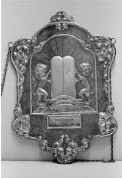
Figure 9: Torah Shield (19th century), Yeshiva University Museum, JCR Collection, Call Nr: 1977.113

By the end of May 1949, only three months after the JCR distribution process had begun, the Offenbach Archival Depot was basically empty of its books. There was still more material at the collecting points in Wiesbaden 260 and Munich, as well as at numerous German libraries and museums throughout the country, but the JCR had nevertheless reached an important milestone. 261