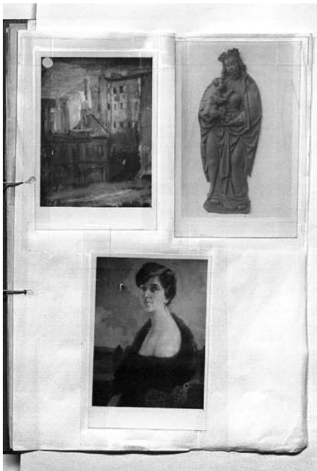
Bundesarchiv 1944: BArch NS 30/178, Kunstgegenstände aus jüdischem Besitz bei der HAG Südosten (1943) 1944

There are presumably additional records of postwar restitution claims submitted by Yugoslavia to the United Kingdom and to France.